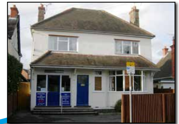
Quaker Meeting House