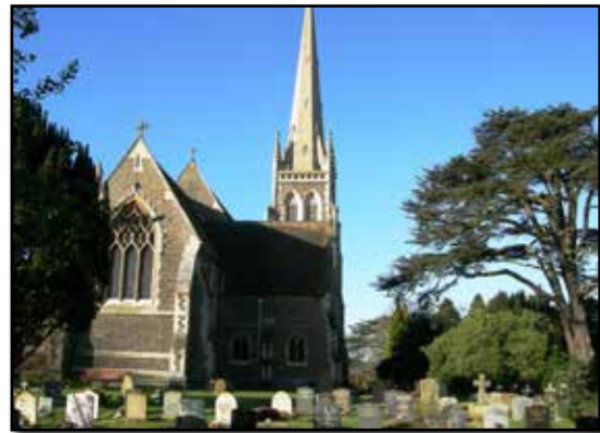
St Paul's Church