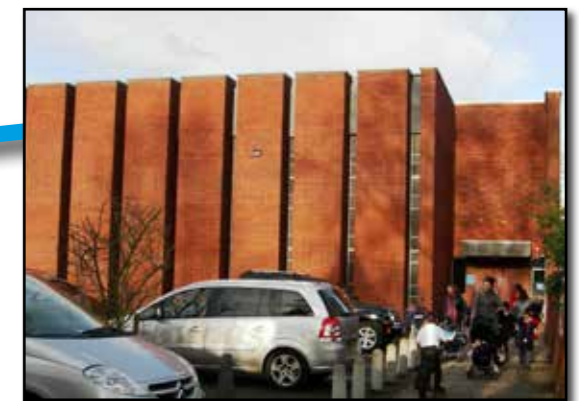
Corpus Christi Church