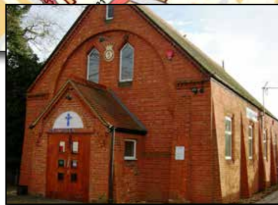
Salvation Army Citadel