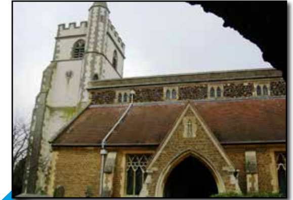
All Saints Church